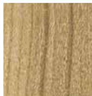
Portofino Cherry (A)