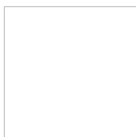
White Pearl (A)