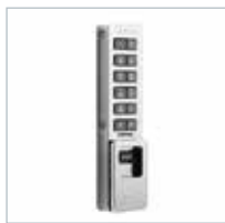
Sola 3 Keyed